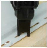
Vinyl siding att available FSM40V